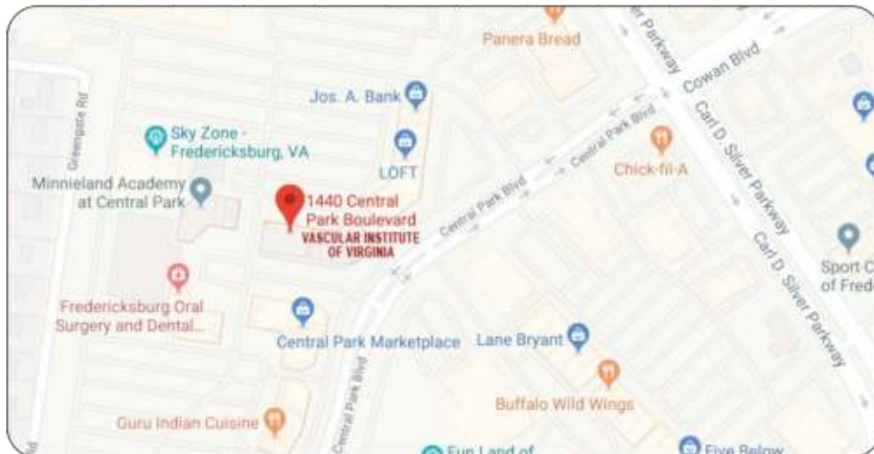
Fredericksburg, VA 22401