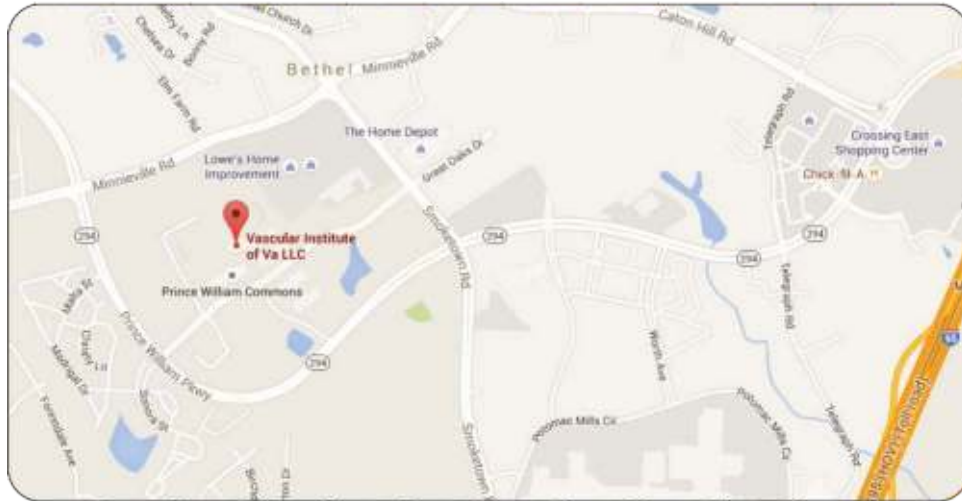
Woodbridge, VA 22193

14085 Crown Ct. • Woodbridge, VA 22193 1440 Central Park Blvd. Suite 108 • Fredericksburg, VA 22401 13135 Lee Jackson Memorial Hwy. Suite 145 • Fairfax, VA 22033 703-763-5224 • Fax 703-763-5374 • www.teamviv.com