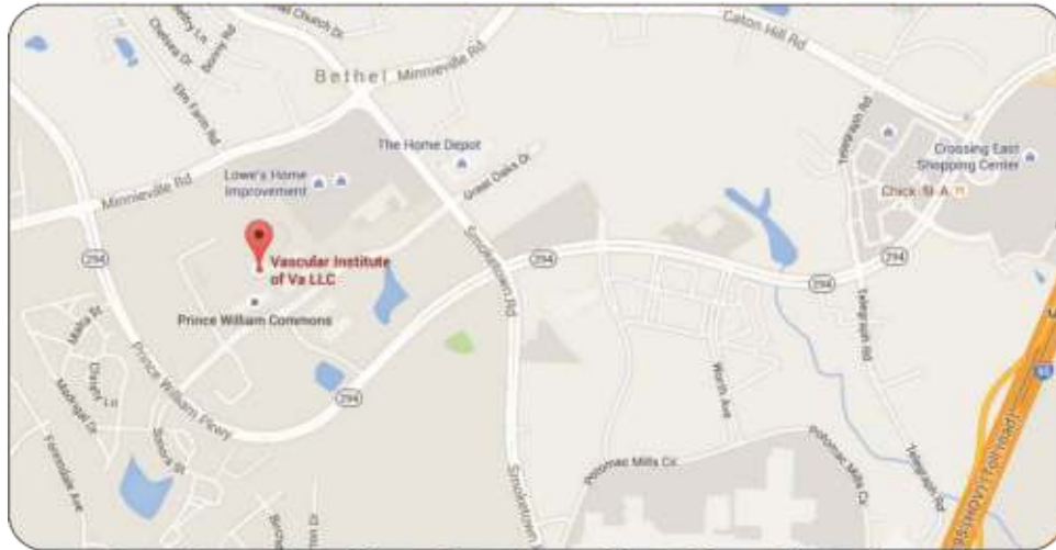
Woodbridge, VA 22193

14085 Crown Ct. • Woodbridge, VA 22193 1440 Central Park Blvd. Suite 108 • Fredericksburg, VA 22401 13135 Lee Jackson Memorial Hwy. Suite 145 • Fairfax, VA 22033 703-763-5224 • Fax 703-763-5374 • www.teamviv.com